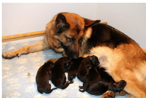
Termi with her puppies in 2012