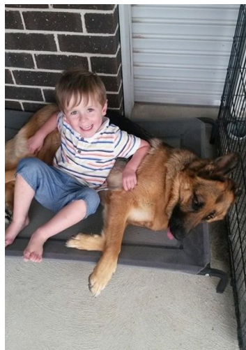
Sia in 2014 at home with Cooper