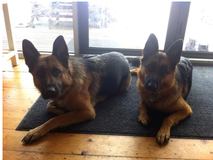
Termi with Bella at her new home in 2013