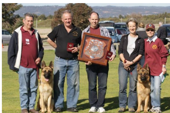
Our 2013 Winning Balmead Team, aiming to win back to back in 2014