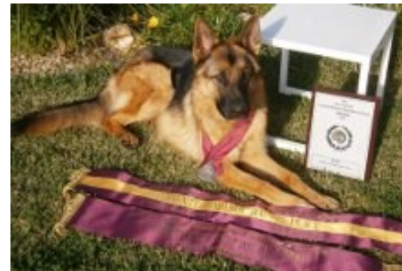
Picture of Gus with his ribbons and trophy from the National